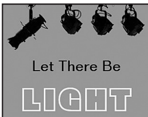
"Let There Be Light" theater Grades 1, 2, and 3