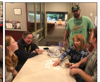
Game Night Fun