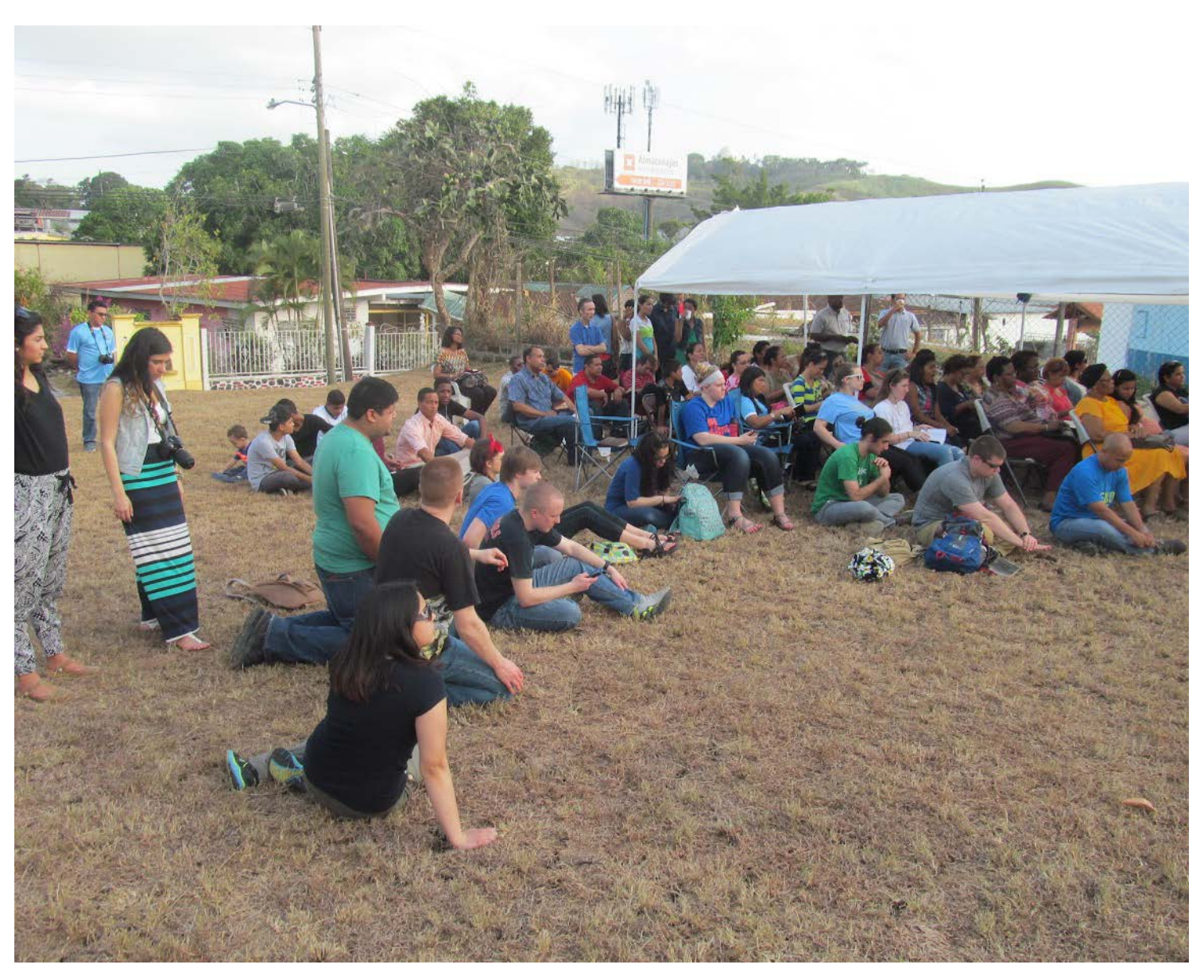
Sunday worship at the church property in Milla 8, San Miguelito, Panama

Meeting in a public school building was always a stopgap measure, and in 2012 we found some centrally located land that would allow us to build. The land cost $150,000 and we did not have the money. But God miraculously provided, and the land was paid off in 2 years. We started workshipping in a temporary structure, but we needed a building, so we decided to build in sections. Much like the widow and the oil pots in 2 Kings 4:1-7, we knew God would fill our needs. And He did!